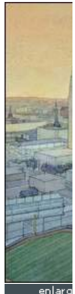
enlarg Rendering of Ave. S. (COUR RELATIONS)

There's one hitch, though. The Atlanta developer backing the project needs a special zoning change to bypass a height restriction that has resulted in the scaling back of a nearby condo project.